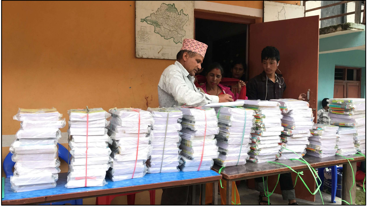
We were also distributing school material like books.