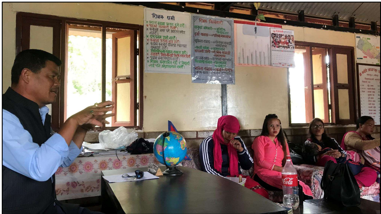
On the left side one can see the headmaster of Bandevi school together with the teachers team.