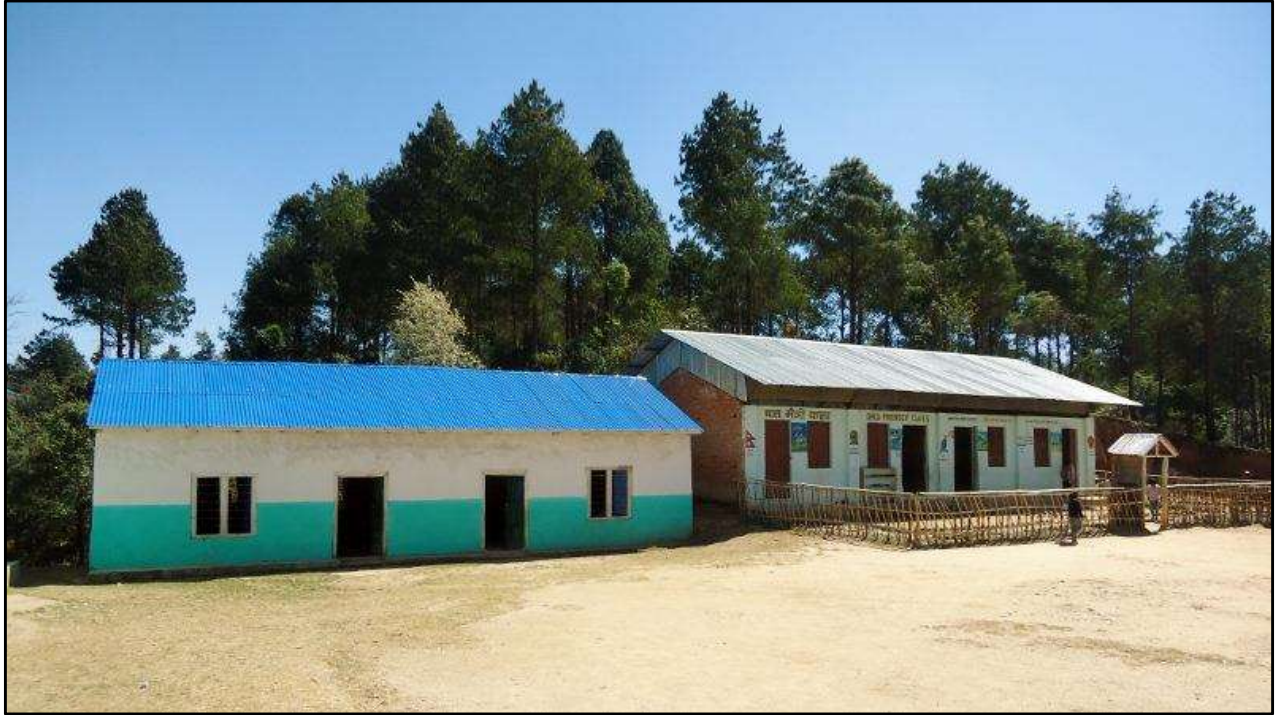
Construction and renovation of two buildings started