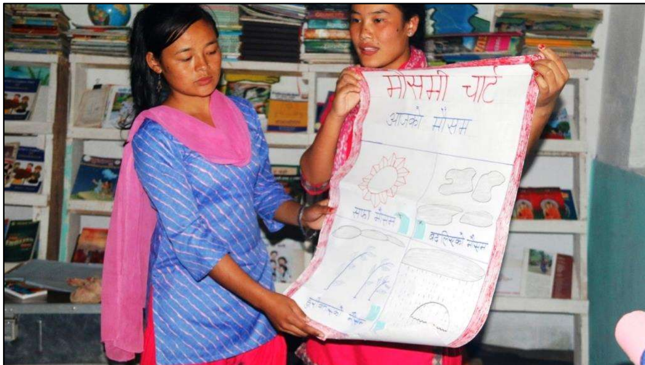
Trainers Teaching started