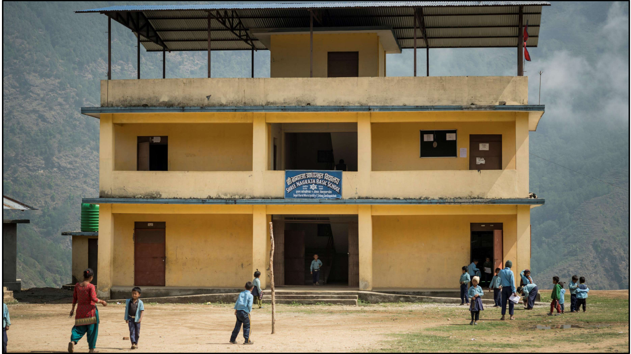
We have also recently assisted in renovating the school building to create additional rooms on the upper floor.