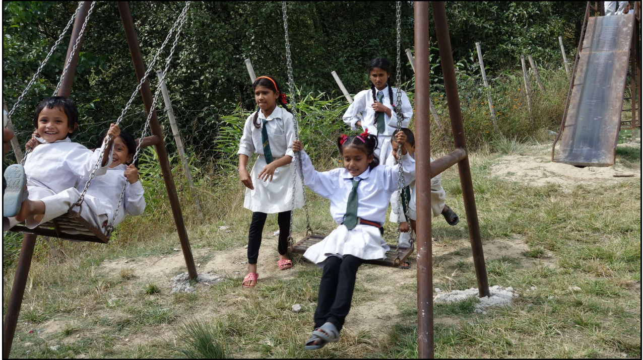
We built playing ground for the kids