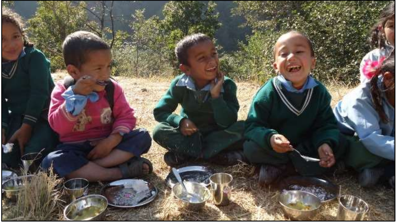
Lunch programme started