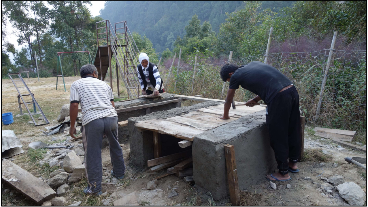
Construction of a tennis table