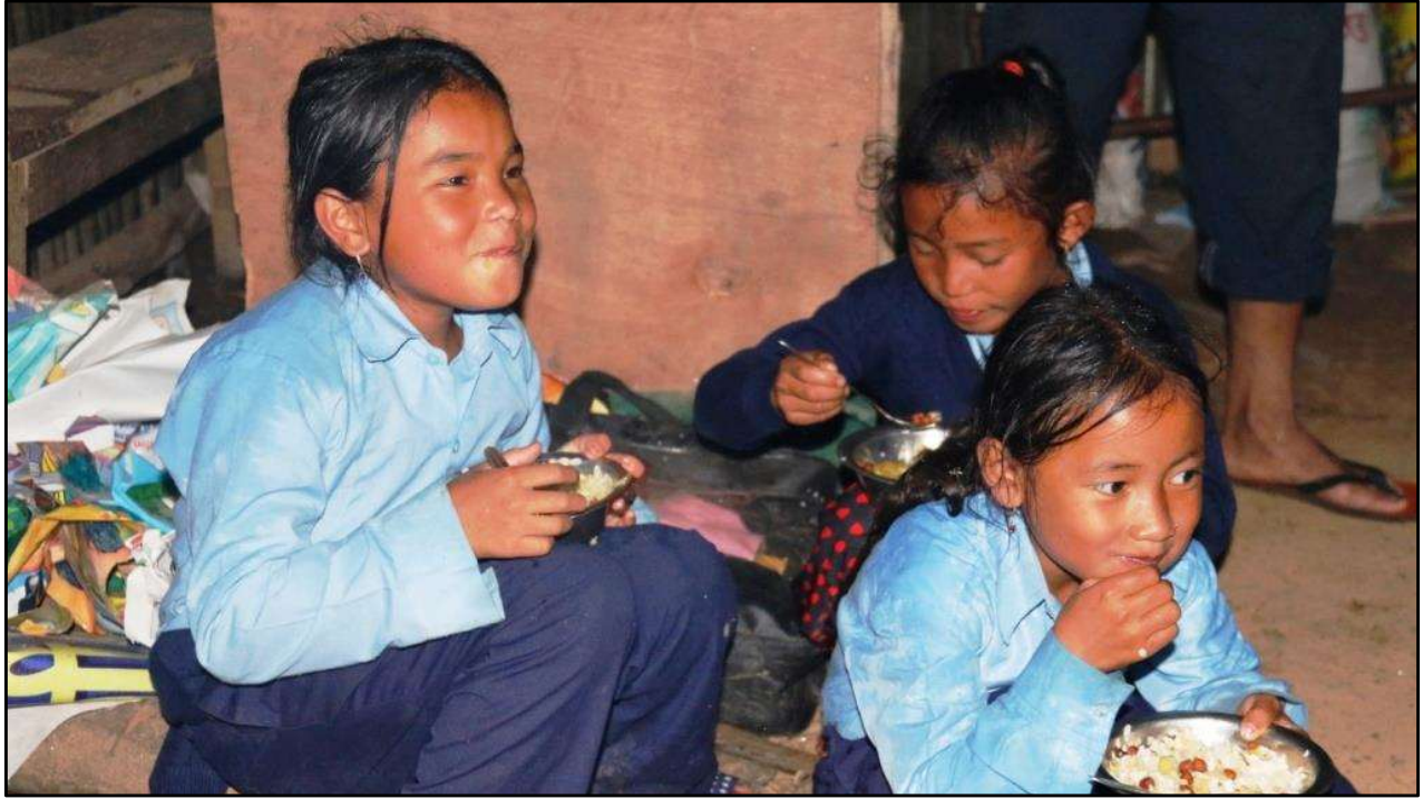
Lunch Programme started